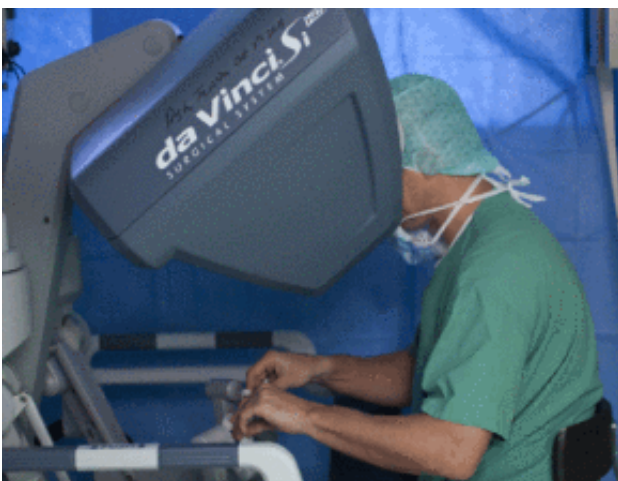
One of Martini Klinik's surgeons working on the da Vinci® console