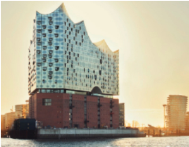
Elbphilharmonie Concert Hall